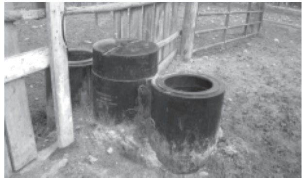
Kornfeld Ranch, Val Marie, SK (306-298-4629) Thermosink Energy-Free water trough using pressurized waterline.