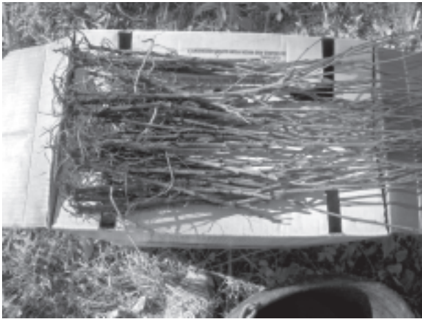
Bare rooted Walker poplars for seeding.

Silvopasture is a new approach to pasture management that involves growing trees and forage on the same parcel of land. A silvopasture requires more work than a simple pasture but, with good management, it produces three marketable end-products: forage, livestock and timber. The forage provides food for the livestock and, once established, the trees provide shelter and shade until they are harvested. In addition, by situating the trees and forage stands to take advantage of