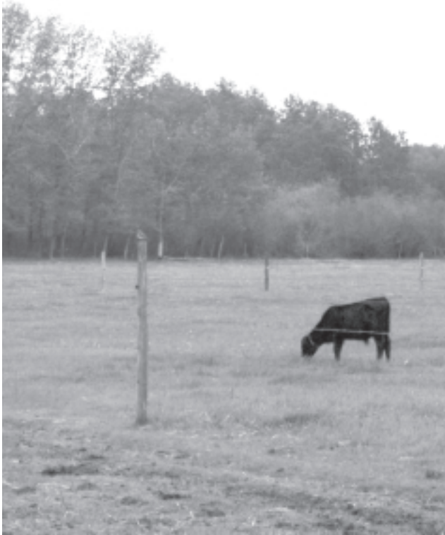
Silvopasture taking root in Saskatchewan (See page 2)

Published by the Livestock & Forage Gazette Committee - Volume 4 Number Two Return address - Saskatchewan Forage Council, 72 Campus Drive, Saskatoon, SK S7N 5B5 Publications Agreement # 40028890