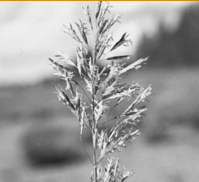
Smooth Brome Grass